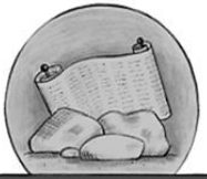
First Sunday in Lent