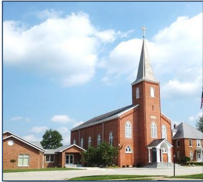
St. Maurice Napoleon

Three unique parishes joined in mutual support to live and spread the gospel, provide enhanced worship opportunities, further faith formation, welcome and reach out in love to those in need. (Cohort Mission Statement)