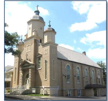
St. John the Baptist Osgood