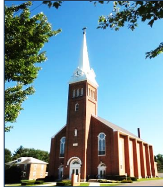
Immaculate Conception Millhousesen