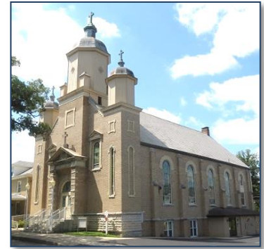
St. John the Baptist Osgood