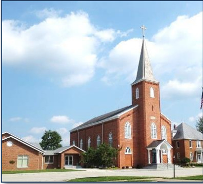
St. Maurice Napoleon

Three unique parishes joined in mutual support to live and spread the gospel, provide enhanced worship opportunities, further faith formation, welcome and reach out in love to those in need. (Cohort Mission Statement)