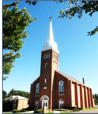
Immaculate Conception Millhousesen