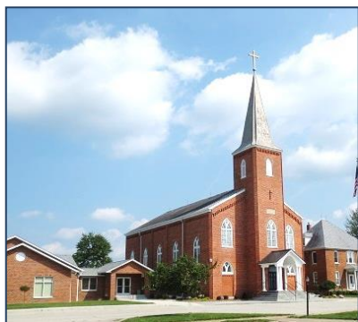
St. Maurice Napoleon

Three unique parishes joined in mutual support to live and spread the gospel, provide enhanced worship opportunities, further faith formation, welcome and reach out in love to those in need. (Cohort Mission Statement)