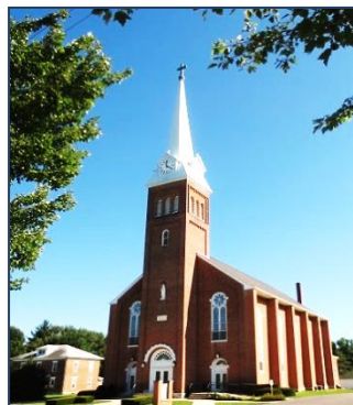
Immaculate Conception Millhousesen