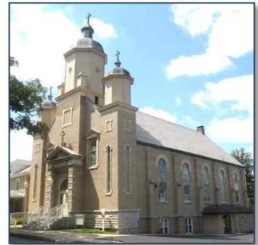
St. John the Baptist Osgood