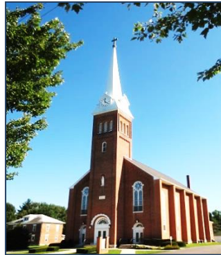
Immaculate Conception Millhousesen