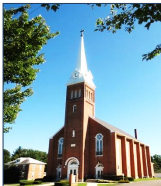
Immaculate Conception Millhousesen