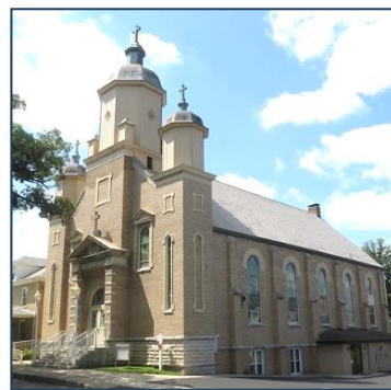
St. John the Baptist Osgood